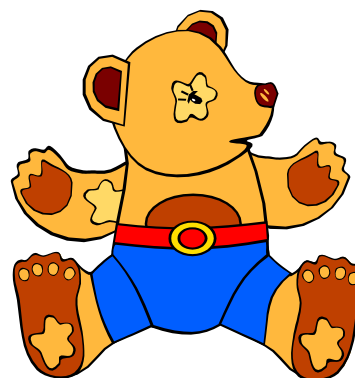
Baby Bear Celebrates a Top Board

Papa Bear no longer has any hearts in Dummy available to ruff a diamond. He'll make his contract because clubs happen to split 3-3, but the overtrick is only a dream.